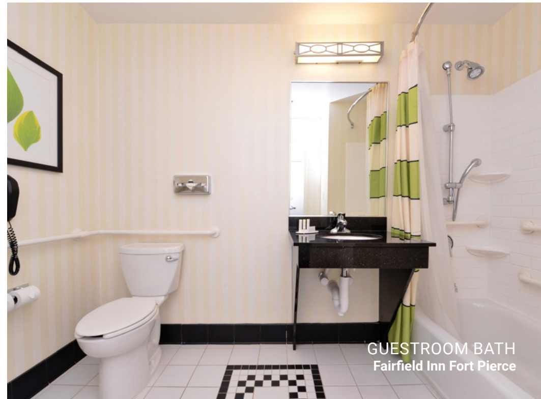
GUESTROOM BATH Fairfield Inn Fort Pierce