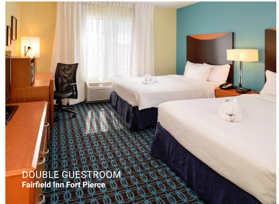
DOUBLE GUESTROOM Fairfield Inn Fort Pierce