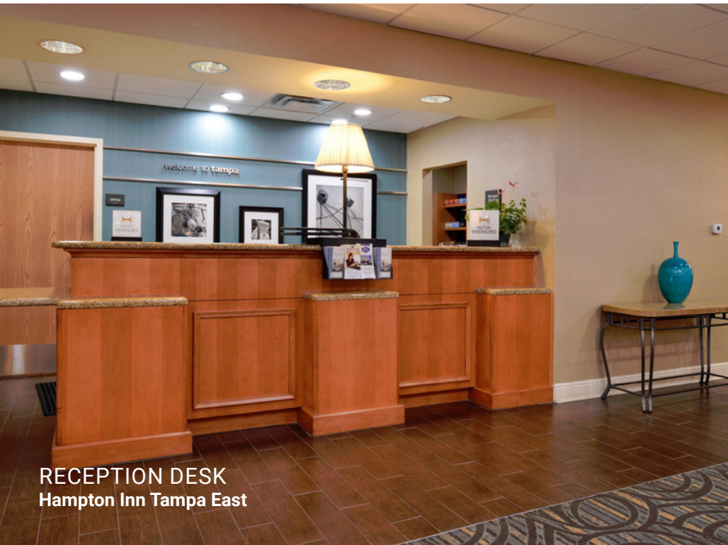
RECEPTION DESK Hampton Inn Tampa East

Liberty has been a prudent steward of the Portfolio, deploying over $10 million among the nine hotels for comprehensive renovations from 2015 to 2017. All properties are in excellent condition and in compliance with their respective flags' brand standard initiatives, such as Hampton Inn's Forever Young and Holiday Inn Express's Formula Blue. Renovations continue to yield positive guest impressions, and more importantly, impressive year-over-year top line and bottom line growth. Because of Liberty's recent reinvestment in its properties, negligible capex post-closing is expected.