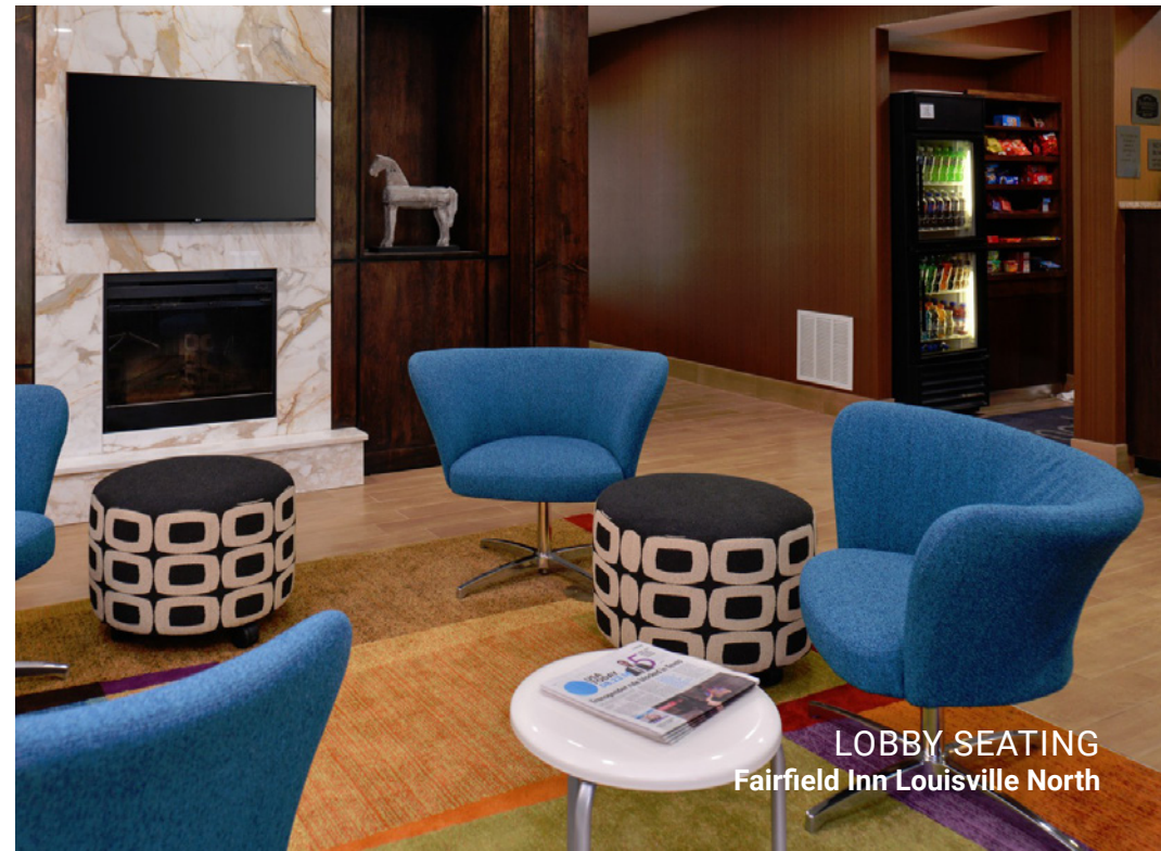
LOBBY SEATING Fairfield Inn Louisville North