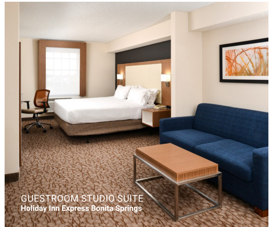
GUESTROOM STUDIO SUITE Holiday Inn Express Bonita Springs