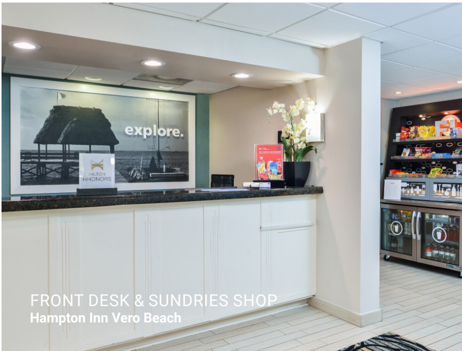
FRONT DESK & SUNDRIES SHOP Hampton Inn Vero Beach