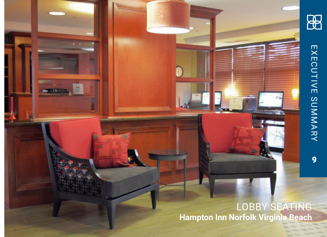
LOBBY SEATING Hampton Inn Norfolk Virginia Beach

Liberty is proud to partner with several global hospitality brands, including Marriott, Hilton, Starwood, Wyndham, and IHG, allowing the firm to immediately step in and manage a vast number of hotel rooms nationwide. These established relationships, and accompanying knowledge base, allow Liberty to maximize value with their existing assets and also on the development front, where Liberty remains first in brands' minds for upcoming development opportunities.