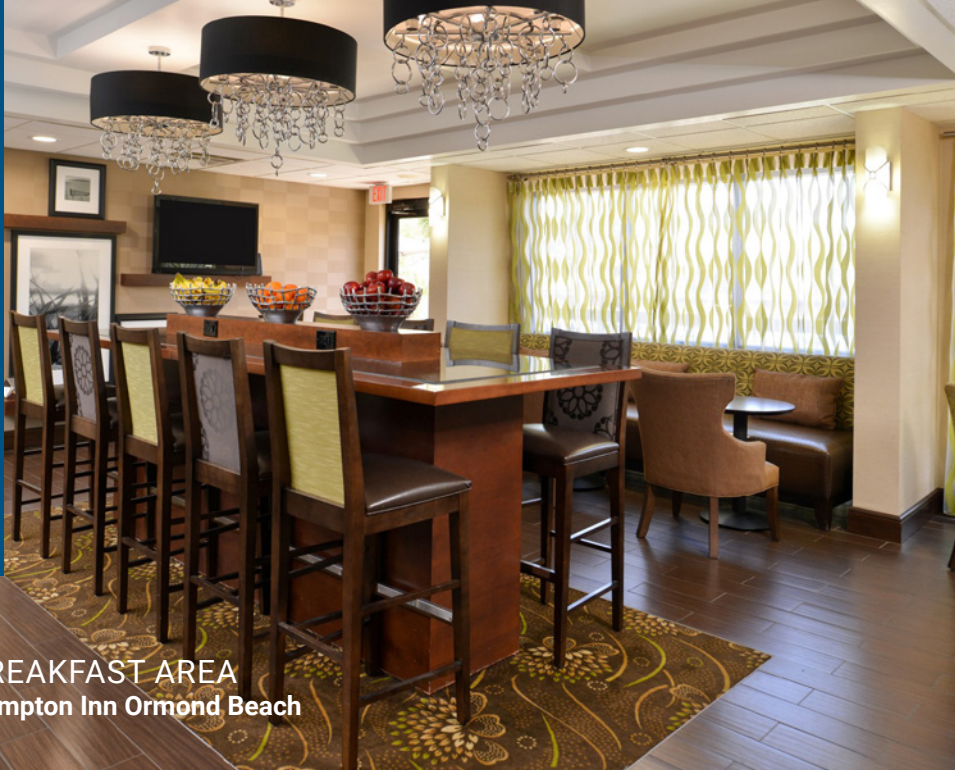
BREAKFAST AREA Hampton Inn Ormond Beach