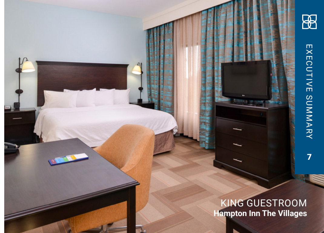
KING GUESTROOM Hampton Inn The Villages

The Portfolio is managed by Liberty Hospitality Management, an affiliate of Liberty, founded in 1980. Over the years, Liberty has managed more than 55 hotels across the United States, in each case striving to maximize efficiency and profitability through robust sales and marketing, revenue management, and detail-oriented operations. The Portfolio is the beneficiary of Liberty's institutional-caliber management platform: in 2017, the Portfolio-wide GOP margin was nearly 45%, while over 33% was brought to the bottom line, after reserves.