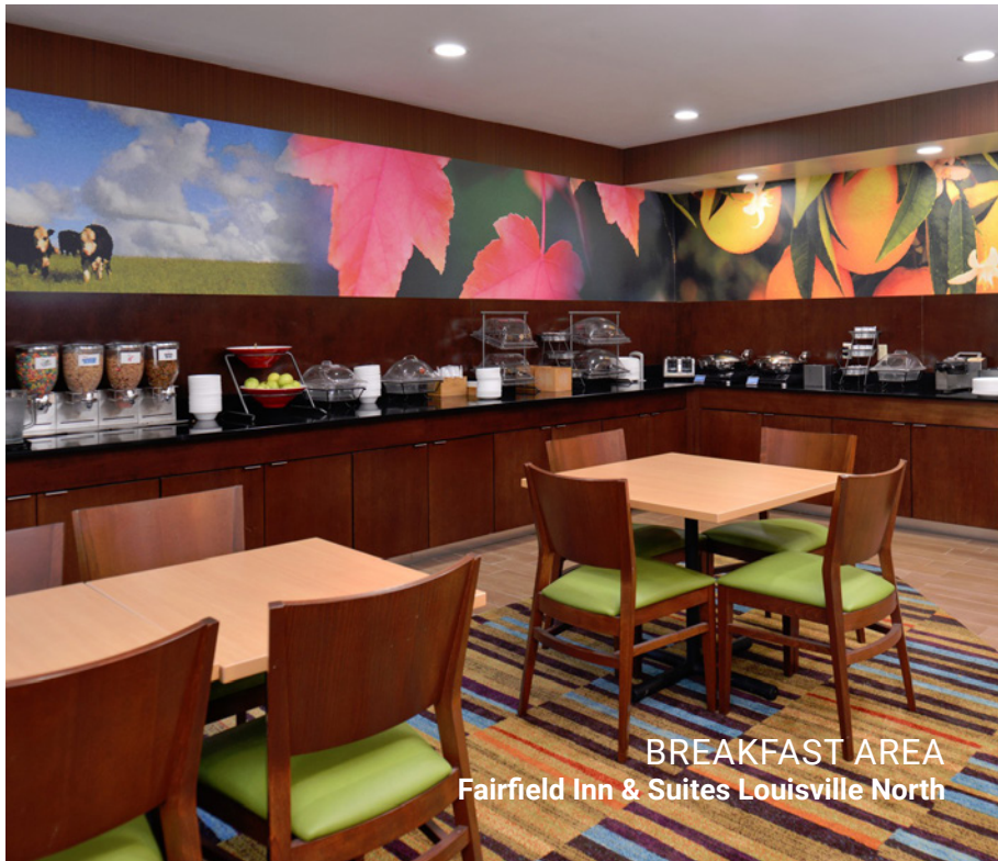
BREAKFAST AREA Fairfield Inn & Suites Louisville North