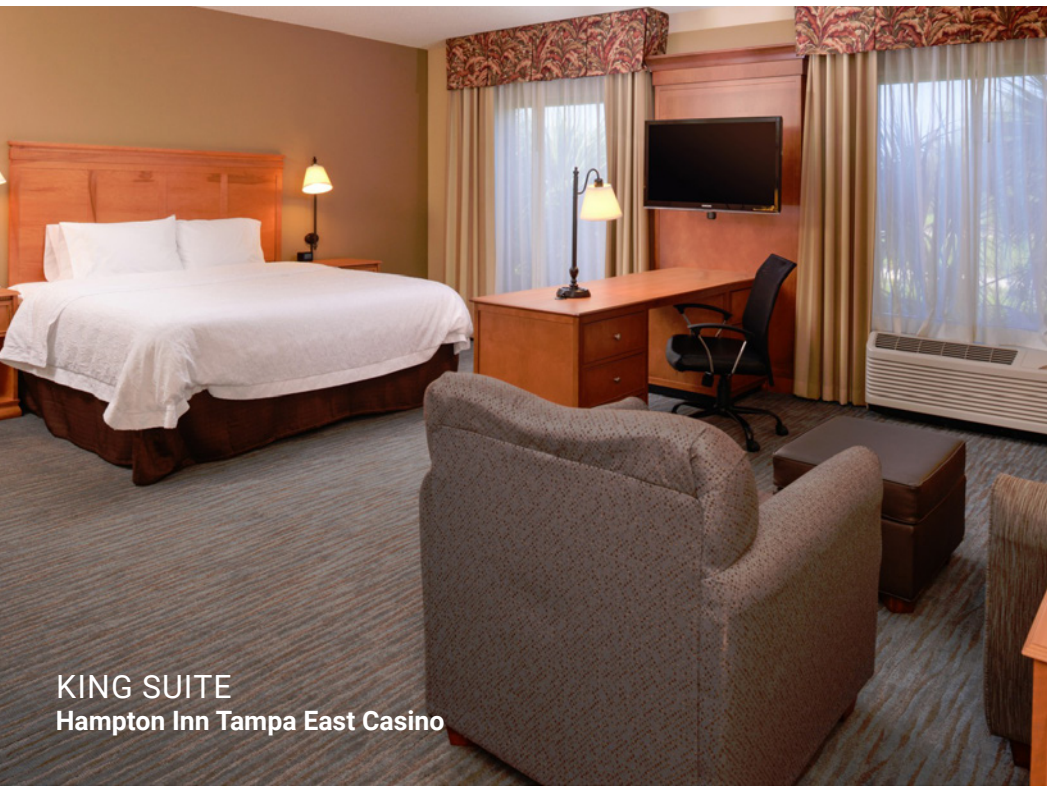
KING SUITE Hampton Inn Tampa East Casino

Over its nearly 40 years of existence, the linchpin of Liberty's success has been active and aggressive management at the property level. Through a rigorous system of in-person property visits and conference calls with its onsite teams, Liberty is able to maintain real-time awareness of the status of each of its properties and is better able to implement appropriate strategies accordingly, particularly in revenue management. On property, Liberty provides superior guest services and fosters strong associate culture through thoughtful in-house hiring and training platforms.