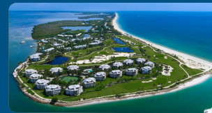
SOUTH SEAS ISLAND RESORT Captiva