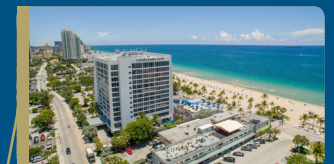
COURTYARD FORT LAUDERDALE BEACH Fort Lauderdale