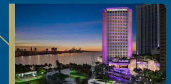
INTERCONTINENTAL MIAMI Miami

► For a list of representative projects and clients in the State of Florida, please visit: tpghotels.com/Florida