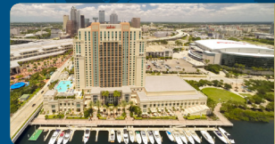
MARRIOTT TAMPA WATERSIDE Tampa