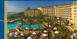
AMELIA ISLAND PLANTATION Fernandina Beach