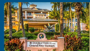
DOUBLETREE GRAND KEY RESORT Key West