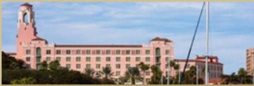
The Vinoy Renaissance Resort & Golf Club St. Petersburg, Florida Repositioning & Conversion