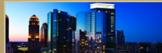
Loews Atlanta Atlanta, Georgia Repositioning & Conversion