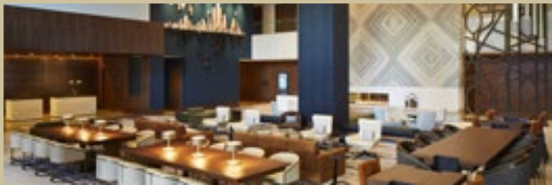
Loews Chicago Chicago, Illinois Ground-Up Development