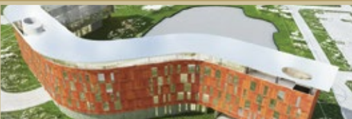
UF Shands Hotel Eleo Gainesville, Florida Ground-Up Development