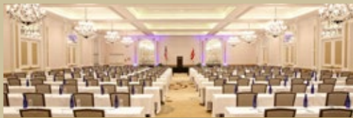
Fairmont Washington, D.C. Georgetown Washington, D.C. Renovation

Our experience spans across various property types, geographic markets and project scopes. Three decades of specialization in the lodging industry means we have the knowledge needed to anticipate and overcome the unique challenges of hotel and resort development and renovation projects.