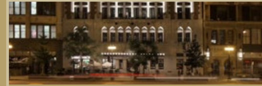
Chicago Athletic Association Hotel Chicago, Illinois Repositioning & Conversion