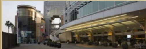
Loews Hollywood Hollywood, California Renovation and Repositioning