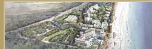
Amelia River Development Amelia River, Florida Development Consulting