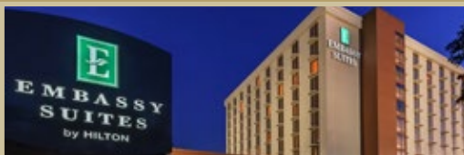
Embassy Suites Dallas Dallas, Texas Renovation