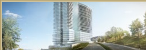
NBC Universal Hollywood Studios Hotels Universal City, California Development Consulting