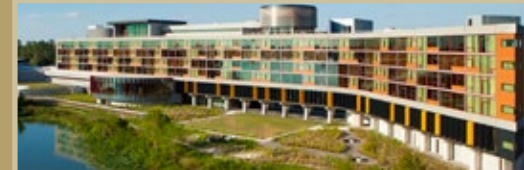
Streamsong Resort Bowling Green, Florida Ground-Up Development