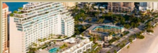
The Ritz-Carlton Fort Lauderdale Fort Lauderdale, Florida Repositioning & Conversion