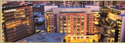
Texas Medical Center Hotel Houston, Texas Ground-up Development